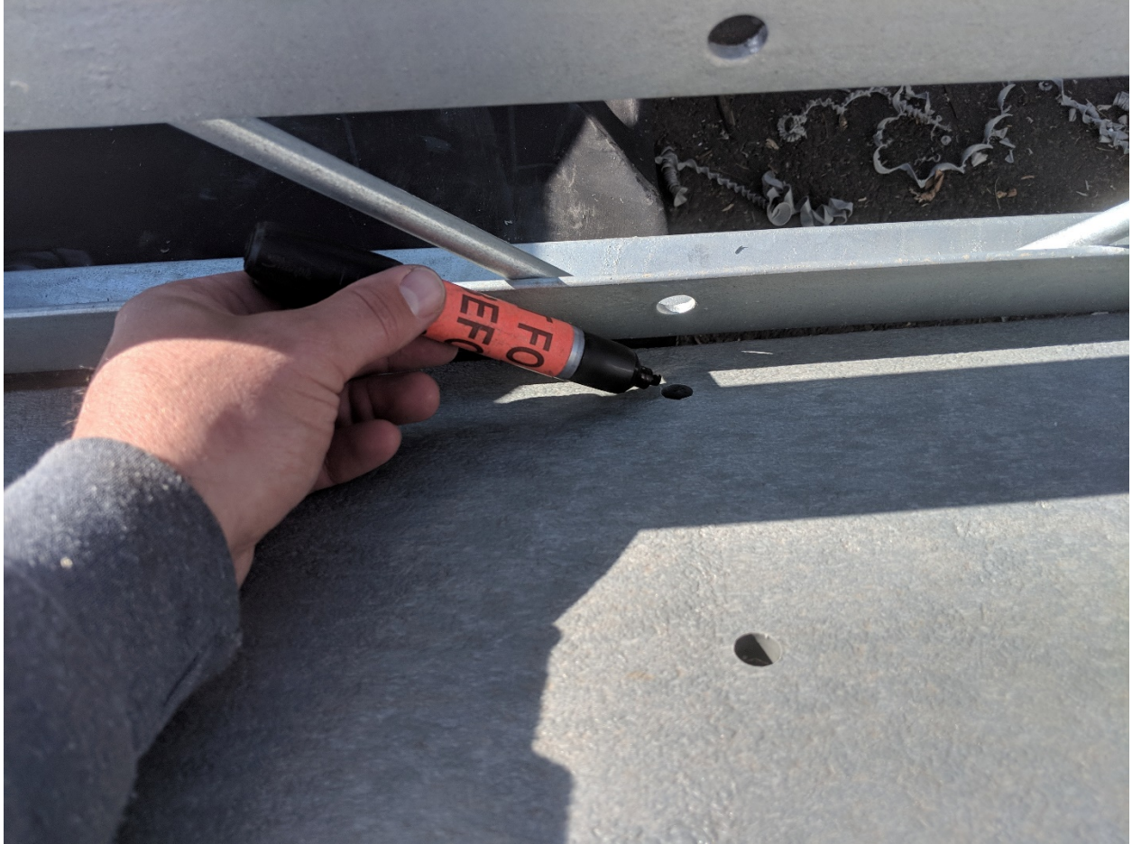
Step 7 continued